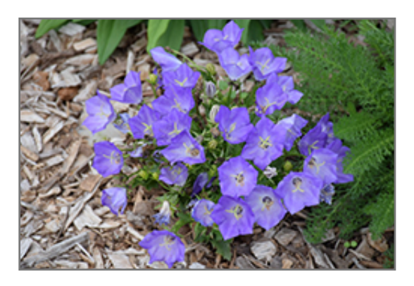
Pristar Deep Blue Bellflower in bloom