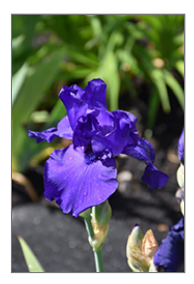
Royal Touch Iris flowers

Royal Touch Iris has masses of beautiful burgundy flag-like flowers with burgundy falls at the ends of the stems in late spring, which are most effective when planted in groupings. The flowers are excellent for cutting. Its sword-like leaves remain green in colour throughout the season.