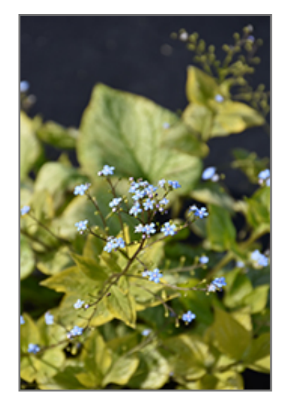
Jack's Gold Bugloss flowers

Jack's Gold Bugloss is an herbaceous perennial with a mounded form. Its relatively coarse texture can be used to stand it apart from other garden plants with finer foliage.