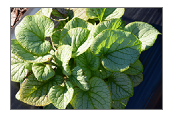
Jack's Gold Bugloss foliage

This is a relatively low maintenance plant, and should be cut back in late fall in preparation for winter. It has no significant negative characteristics.