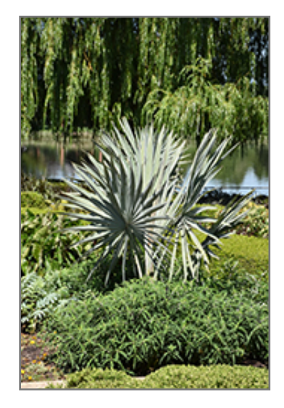
Bismarck Palm