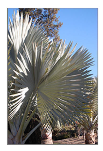
Bismarck Palm foliage

Bismarck Palm is a fine choice for the yard, but it is also a good selection for planting in outdoor pots and containers. Because of its height, it is often used as a 'thriller' in the 'spiller-thriller-filler' container combination; plant it near the center of the pot, surrounded by smaller plants and those that spill over the edges. It is even sizeable enough that it can be grown alone in a suitable container. Note that when grown in a container, it may not perform exactly as indicated on the tag - this is to be expected. Also note that when growing plants in outdoor containers and baskets, they may require more frequent waterings than they would in the yard or garden. Be aware that in our climate, most plants cannot be expected to survive the winter if left in containers outdoors, and this plant is no exception. Contact our experts for more information on how to protect it over the winter months.