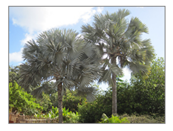
Bismarck Palm

This tropical plant should only be grown in full sunlight. It is very adaptable to both dry and moist locations, and should do just fine under average home landscape conditions. It is considered to be drought-tolerant, and thus makes an ideal choice for xeriscaping or the moisture-conserving landscape. It is not particular as to soil type or pH. It is somewhat tolerant of urban pollution. This species is not originally from North America.