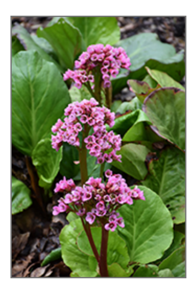
Rotblum Heartleaf Bergenia flowers