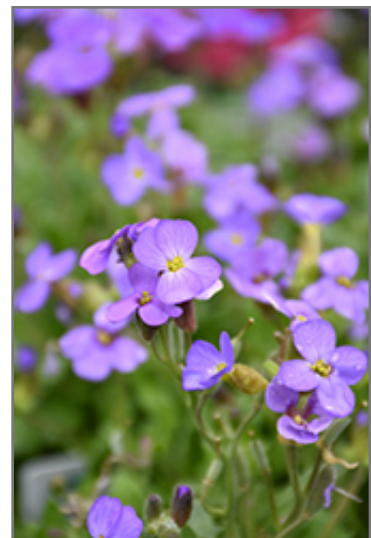
Cascade Blue Rock Cress flowers