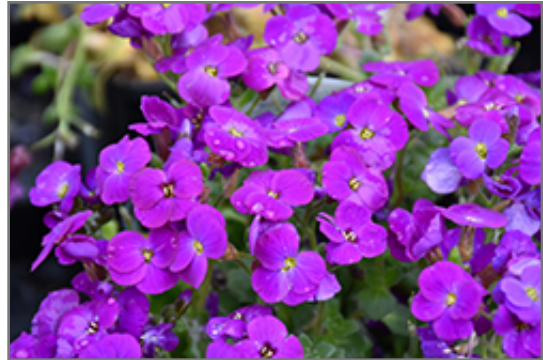
Axcent Deep Purple Rock Cress flowers