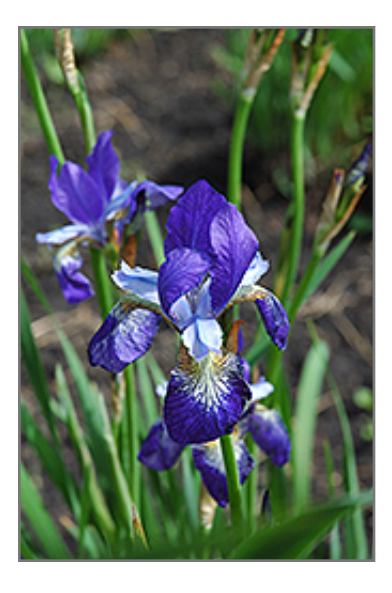
Perky Siberian Iris flowers

Perky Siberian Iris has masses of beautiful royal blue flag-like flowers with white throats and royal blue falls at the ends of the stems in mid spring, which are most effective when planted in groupings. The flowers are excellent for cutting. Its sword-like leaves remain green in colour throughout the season.