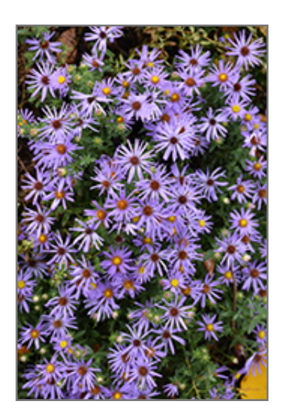
Raydon's Favorite Aster flowers