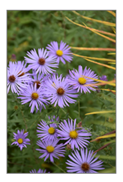
Fanny Aster flowers