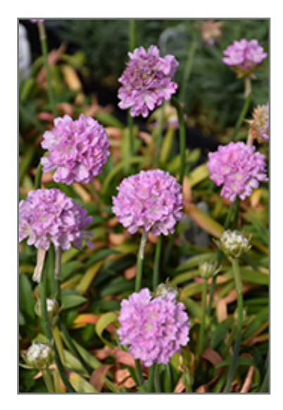
Dreameria Sweet Dreams False Sea Thrift flowers

A breakthrough series, providing beautiful blooms from frost to frost; remove old flowers once a month for best re-blooming performance; perfect for massing in the garden or containers; very heat tolerant, and easy to grow