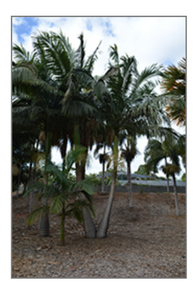
Walsh River Palm