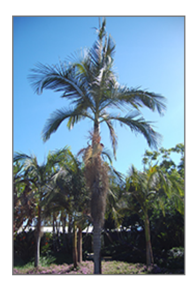
Walsh River Palm

This tropical plant does best in full sun to partial shade. It prefers to grow in average to moist conditions, and shouldn't be allowed to dry out. It is not particular as to soil type or pH. It is somewhat tolerant of urban pollution. This species is not originally from North America.