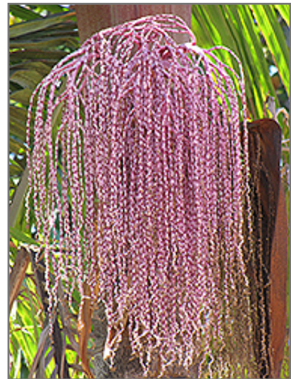
Bangalow Palm flowers