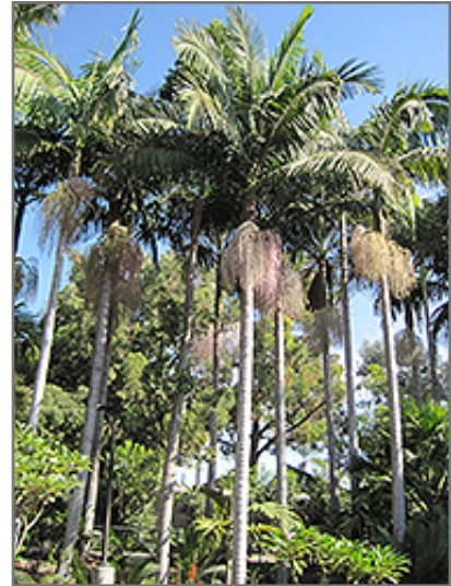
Bangalow Palm

This tropical plant does best in full sun to partial shade. It prefers to grow in average to moist conditions, and shouldn't be allowed to dry out. It is not particular as to soil type or pH. It is somewhat tolerant of urban pollution. This species is not originally from North America.