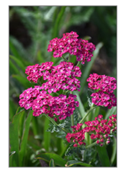
Ritzy Rose Yarrow flowers

Ritzy Rose Yarrow is recommended for the following landscape applications;