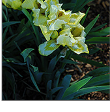
Pacman Iris flowers

Pacman Iris has masses of beautiful yellow flag-like flowers with white edges at the ends of the stems in mid spring, which are most effective when planted in groupings. The flowers are excellent for cutting. Its sword-like leaves remain green in colour throughout the season.