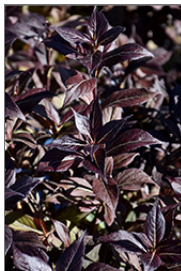
Date Night Stunner Weigela foliage