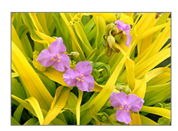
Sunshine Charm Spiderwort flowers

Sunshine Charm Spiderwort is recommended for the following landscape applications;