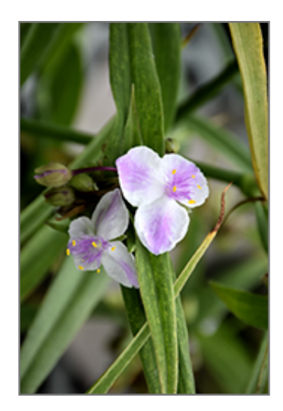
Pink Chablis Spiderwort flowers

This selection is an excellent plant for borders, rock gardens, and massed as groundcover; a prolific bloomer with beautiful pale pink flowers accented with ruffled white edges; dense mounded foliage is mid-green and attractive