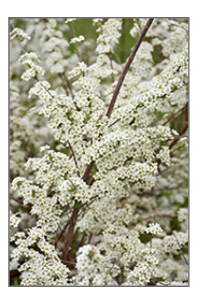
First Snow Spirea flowers

First Snow Spirea is clothed in stunning fragrant white flowers along the branches in early spring before the leaves. It has bluish-green deciduous foliage. The small narrow leaves turn coppery-bronze in fall.