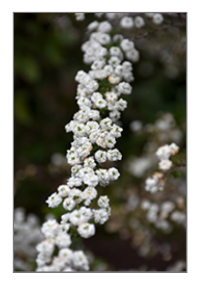
Bridalwreath Spirea flowers