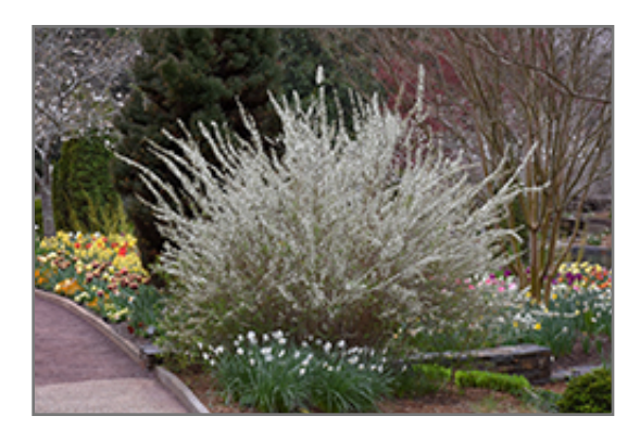
Bridalwreath Spirea in bloom

Bridalwreath Spirea is recommended for the following landscape applications;