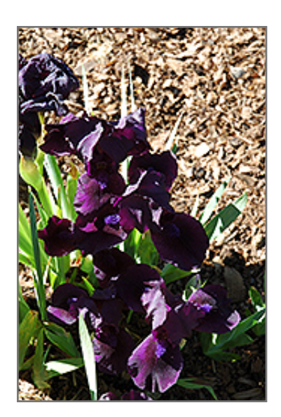
Michael Paul Iris flowers

Michael Paul Iris has masses of beautiful indigo flag-like flowers with a blue beard at the ends of the stems in mid spring, which are most effective when planted in groupings. The flowers are excellent for cutting. Its sword-like leaves remain green in colour throughout the season.