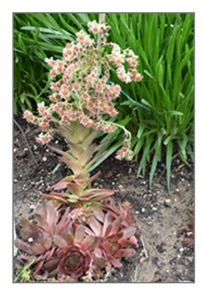
Peggy Hens And Chicks in bloom

Peggy Hens And Chicks will grow to be only 5 inches tall at maturity extending to 12 inches tall with the flowers, with a spread of 8 inches. When grown in masses or used as a bedding plant, individual plants should be spaced approximately 8 inches apart. Its foliage tends to remain low and dense right to the ground. It grows at a medium rate, and under ideal conditions can be expected to live for approximately 20 years. As an herbaceous perennial, this plant will usually die back to the crown each winter, and will regrow from the base each spring. Be careful not to disturb the crown in late winter when it may not be readily seen!