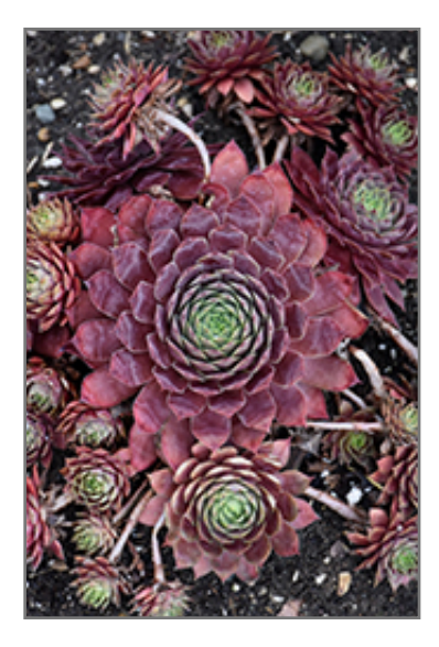
Peggy Hens And Chicks

This plant will require occasional maintenance and upkeep, and should not require much pruning, except when necessary, such as to remove dieback. Deer don't particularly care for this plant and will usually leave it alone in favor of tastier treats. Gardeners should be aware of the following characteristic(s) that may warrant special consideration;