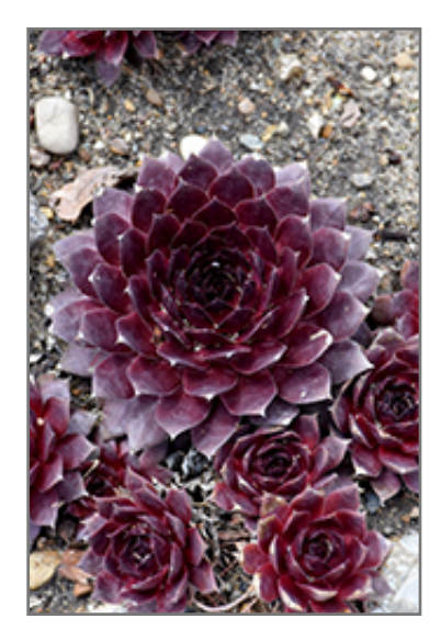
Peggy Hens And Chicks