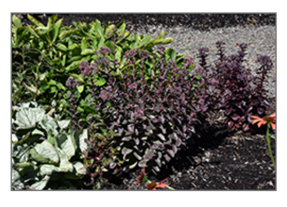
Raspberry Truffle Stonecrop in bloom

Raspberry Truffle Stonecrop features showy clusters of pink star-shaped flowers rising above the foliage from early to late summer, which emerge from distinctive rose flower buds. The flowers are excellent for cutting. Its attractive succulent round leaves emerge olive green in spring, turning burgundy in colour with hints of purple throughout the season. The cherry red stems are very colorful and add to the overall interest of the plant.