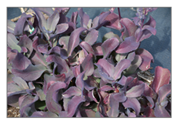
Raspberry Truffle Stonecrop foliage