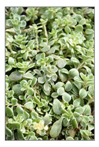
Variegated Japanese Stonecrop foliage