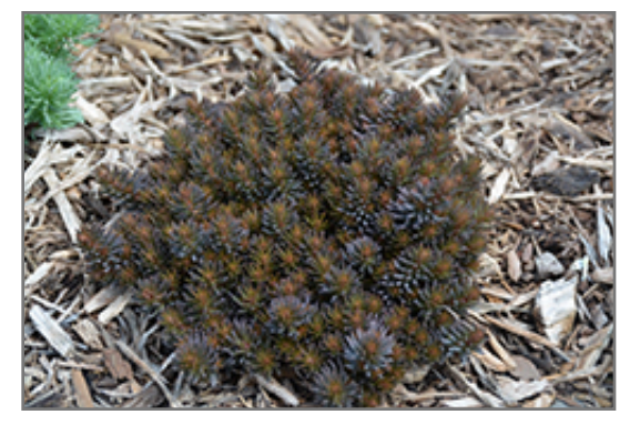
Chocolate Ball Stonecrop

Chocolate Ball Stonecrop will grow to be about 8 inches tall at maturity, with a spread of 15 inches. When grown in masses or used as a bedding plant, individual plants should be spaced approximately 12 inches apart. It grows at a fast rate, and under ideal conditions can be expected to live for approximately 15 years. As an herbaceous perennial, this plant will usually die back to the crown each winter, and will regrow from the base each spring. Be careful not to disturb the crown in late winter when it may not be readily seen!