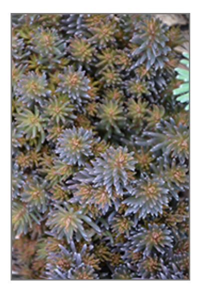
Chocolate Ball Stonecrop foliage

Chocolate Ball Stonecrop is a dense herbaceous perennial with a mounded form. Its relatively coarse texture can be used to stand it apart from other garden plants with finer foliage.