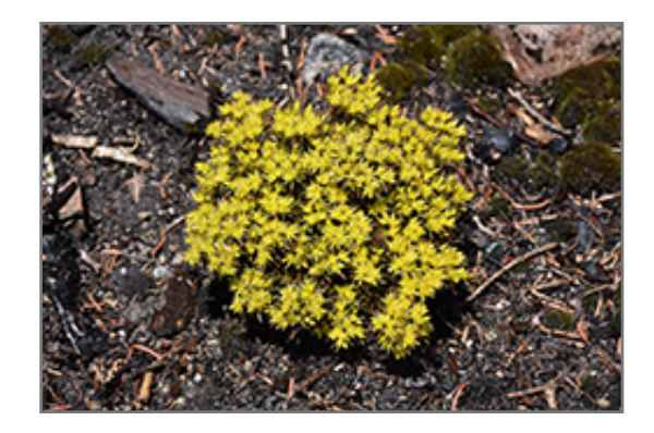
Chocolate Ball Stonecrop in bloom