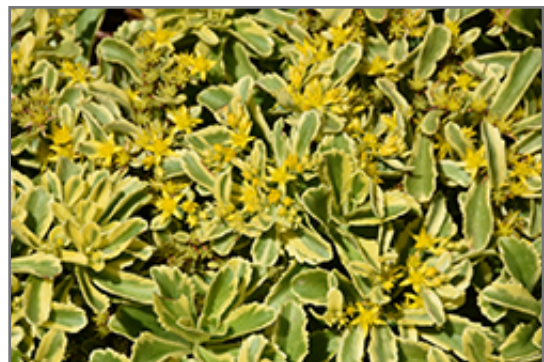
Cutting Edge Stonecrop flowers