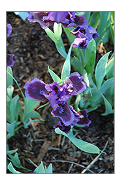
Little Episode Iris flowers

Little Episode Iris has masses of beautiful purple flag-like flowers with blue edges at the ends of the stems in mid spring, which are most effective when planted in groupings. The flowers are excellent for cutting. Its sword-like leaves remain green in colour throughout the season.