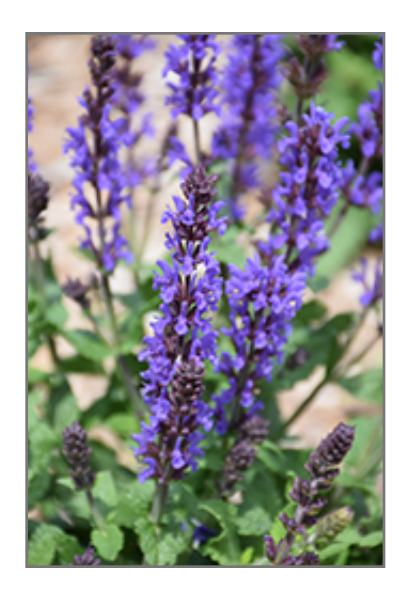
Spring King Mini Meadow Sage flowers

Spring King Mini Meadow Sage is an herbaceous perennial with an upright spreading habit of growth. Its relatively fine texture sets it apart from other garden plants with less refined foliage.