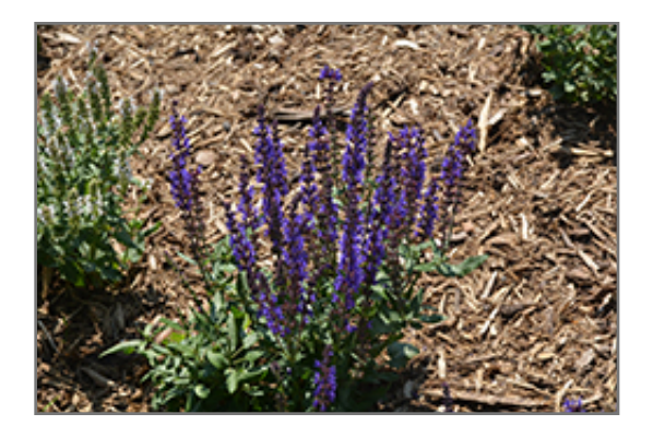
Spring King Mini Meadow Sage in bloom

This is a relatively low maintenance plant, and is best cleaned up in early spring before it resumes active growth for the season. It is a good choice for attracting butterflies and hummingbirds to your yard, but is not particularly attractive to deer who tend to leave it alone in favor of tastier treats. It has no significant negative characteristics.