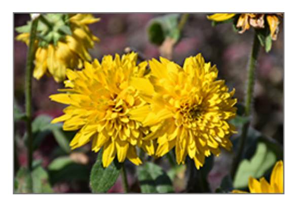
Gloriosa Double Daisy Coneflower flowers