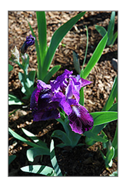
Joette Iris flowers