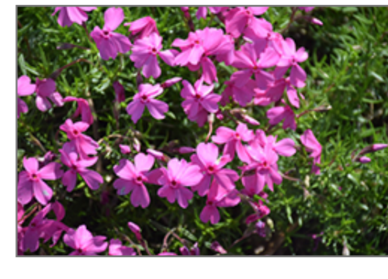
Spring Light Pink Moss Phlox flowers