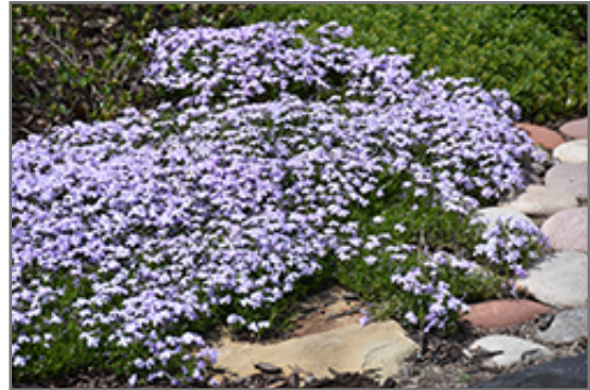
Spring Lavender Moss Phlox in bloom

This plant will require occasional maintenance and upkeep, and should only be pruned after flowering to avoid removing any of the current season's flowers. Deer don't particularly care for this plant and will usually leave it alone in favor of tastier treats. Gardeners should be aware of the following characteristic(s) that may warrant special consideration;