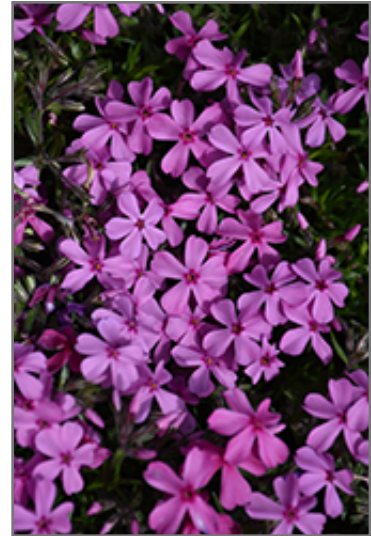
Spring Dark Pink Moss Phlox flowers