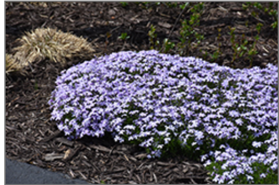
Spring Blue Moss Phlox in bloom

This plant will require occasional maintenance and upkeep, and should only be pruned after flowering to avoid removing any of the current season's flowers. Deer don't particularly care for this plant and will usually leave it alone in favor of tastier treats. Gardeners should be aware of the following characteristic(s) that may warrant special consideration;