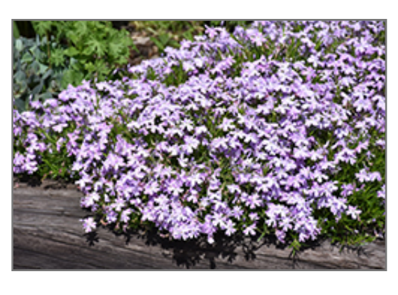
Emerald Queen Moss Phlox in bloom

A vigorous variety, with a showy display of lavender-pink flowers; has excellent disease resistance; clip plants lightly immediately after blooming to encourage a dense habit; wonderful in a sunny rock garden, for edging, or in mixed containers