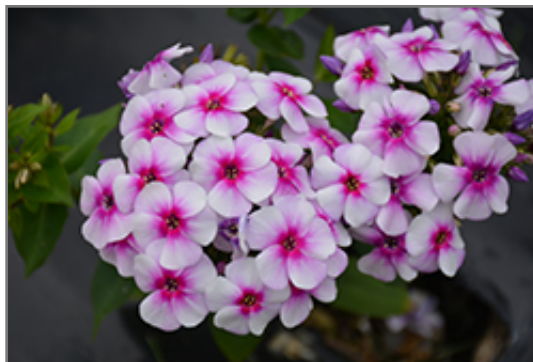
Ka-Pow White Bicolor Garden Phlox flowers

Ka-Pow White Bicolor Garden Phlox is recommended for the following landscape applications;