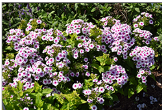
Ka-Pow White Bicolor Garden Phlox in bloom