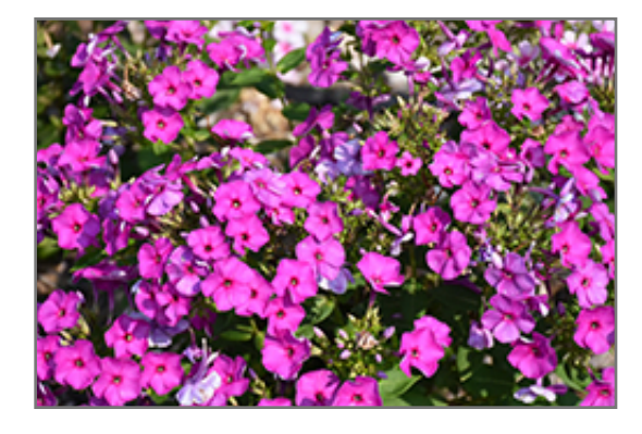
Ka-Pow Purple Garden Phlox flowers

Ka-Pow Purple Garden Phlox is recommended for the following landscape applications;