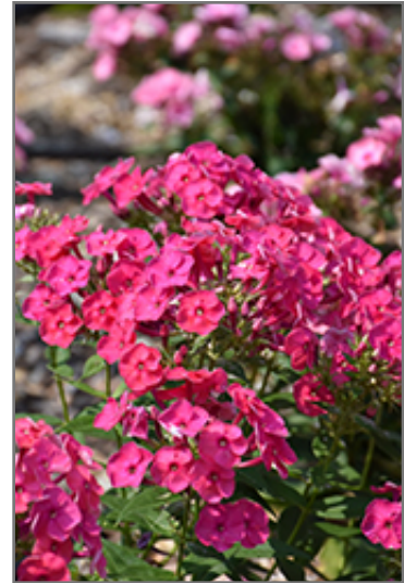
Ka-Pow Pink Garden Phlox flowers