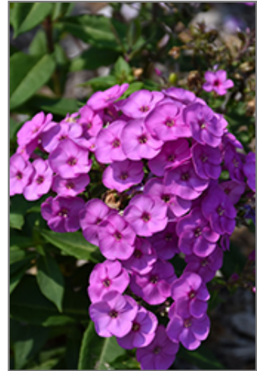
Ka-Pow Lavender Garden Phlox flowers