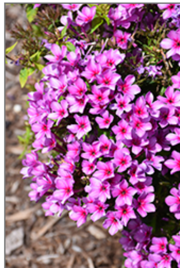
Early Purple Pink Eye Garden Phlox flowers