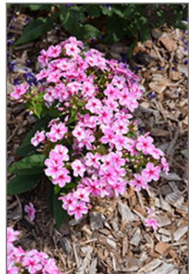
Early Pink Candy Garden Phlox flowers