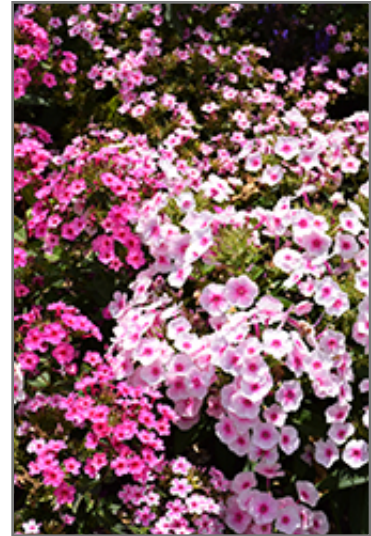
Early Pink Candy Garden Phlox flowers

Early Pink Candy Garden Phlox is a fine choice for the garden, but it is also a good selection for planting in outdoor pots and containers. It is often used as a 'filler' in the 'spiller-thriller-filler' container combination, providing a mass of flowers against which the larger thriller plants stand out. Note that when growing plants in outdoor containers and baskets, they may require more frequent waterings than they would in the yard or garden. Be aware that in our climate, most plants cannot be expected to survive the winter if left in containers outdoors, and this plant is no exception. Contact our experts for more information on how to protect it over the winter months.