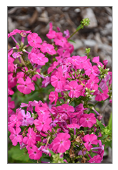
Kung Fuchsia Garden Phlox flowers

A stunning hybrid producing masses of intense, bright fuchsia flowers that cover the plant; compact, long blooming, and carefree; suitable for containers or small perennial borders; great mildew resistance; cut back faded flowers to encourage re-blooming