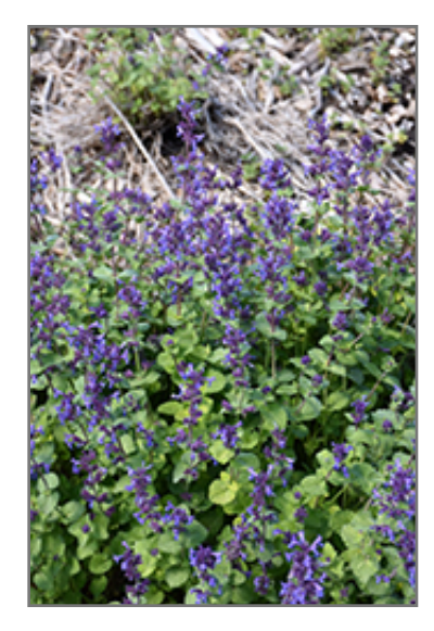
Aroma Violet Catmint flowers

Aroma Violet Catmint is recommended for the following landscape applications;