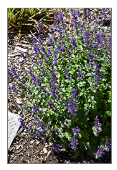
Aroma Violet Catmint flowers