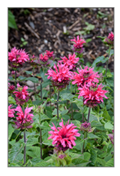
Bee-You Bee-Merry Beebalm flowers

This plant will require occasional maintenance and upkeep, and should be cut back in late fall in preparation for winter. It is a good choice for attracting bees, butterflies and hummingbirds to your yard, but is not particularly attractive to deer who tend to leave it alone in favor of tastier treats. Gardeners should be aware of the following characteristic(s) that may warrant special consideration;