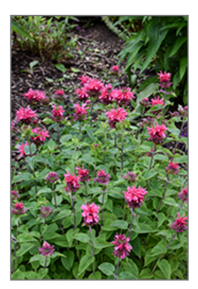
Bee-You Bee-Merry Beebalm in bloom

Bee-You Bee-Merry Beebalm will grow to be about 12 inches tall at maturity, with a spread of 12 inches. When grown in masses or used as a bedding plant, individual plants should be spaced approximately 10 inches apart. It grows at a fast rate, and under ideal conditions can be expected to live for approximately 5 years. As an herbaceous perennial, this plant will usually die back to the crown each winter, and will regrow from the base each spring. Be careful not to disturb the crown in late winter when it may not be readily seen!