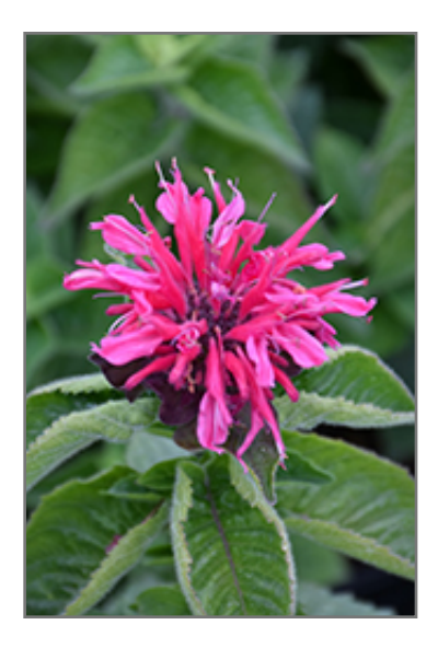
Bee-You Bee-Merry Beebalm flowers