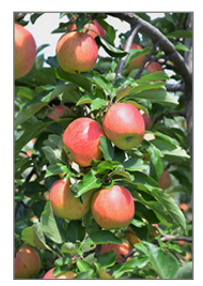
Royal Gala Apple fruit

Royal Gala Apple features showy clusters of lightly-scented white flowers with shell pink overtones along the branches in mid spring, which emerge from distinctive pink flower buds. It has forest green deciduous foliage. The pointy leaves turn yellow in fall. The fruits are showy ruby-red apples with a chartreuse blush, which are carried in abundance from late summer to mid fall. The fruit can be messy if allowed to drop on the lawn or walkways, and may require occasional clean-up.