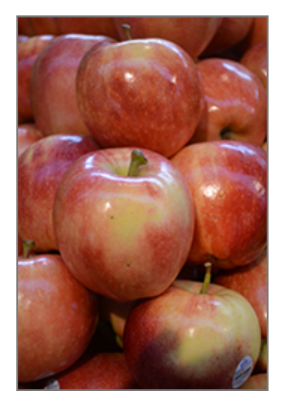
Royal Gala Apple fruit