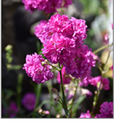
Passion German Catchfly flowers

Native to Europe, this small grassy-like tufted-mound perennial produces stunning clusters of double, magenta-pink blooms; its upright habit makes this plant a spectacular addition to any rock or scree garden; deadhead to encourage prolonged flowering