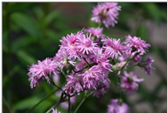
Petite Jenny Ragged Robin Campion flowers

A compact, tufted perennial with oblong, dark green foliage, presenting double, soft lavender-pink flowers that float above the foliage on upright, slender leafy stems; blooms late spring to fall; an extremely showy plant especially when planted in masses