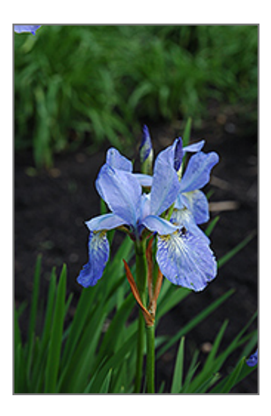
Emperor Siberian Iris flowers

Emperor Siberian Iris has masses of beautiful sky blue flag-like flowers with gold throats and blue falls at the ends of the stems in mid spring, which are most effective when planted in groupings. The flowers are excellent for cutting. Its sword-like leaves remain green in colour throughout the season.