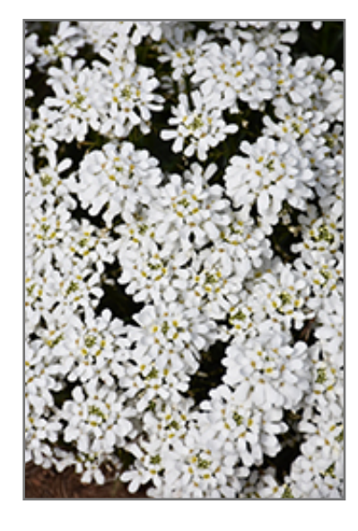
Snowsation Candytuft flowers

This is a relatively low maintenance plant, and should only be pruned after flowering to avoid removing any of the current season's flowers. It has no significant negative characteristics.