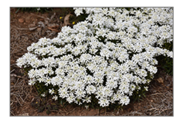
Snowsation Candytuft in bloom

Snowsation Candytuft is recommended for the following landscape applications;