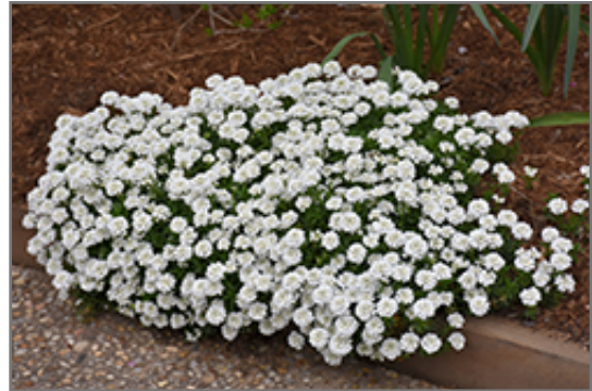
Snowball Candytuft in bloom